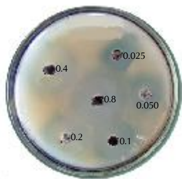
Figure 3: Showing Zone of Inhibition of gentamycin against P. mirabilis

Vitex negundo leaf extract against Proteus mirabilis . Initially the stock cultures of bacteria were revived by inoculating in broth media and grown at 37° C for 18 hrs. the agar plate of above media were prepared and wells were made in the plate. Each plate was inoculated with 18h old cultures (100 \mu L, 104 cfu) and spread evenly on the plate. After 20 min, the wells were filled with different concentrations of samples. The control wells were filled with gentamycin along with solvent. All the plates were incubated at 37°C for 24h and the diameter of inhibition zones were noted.